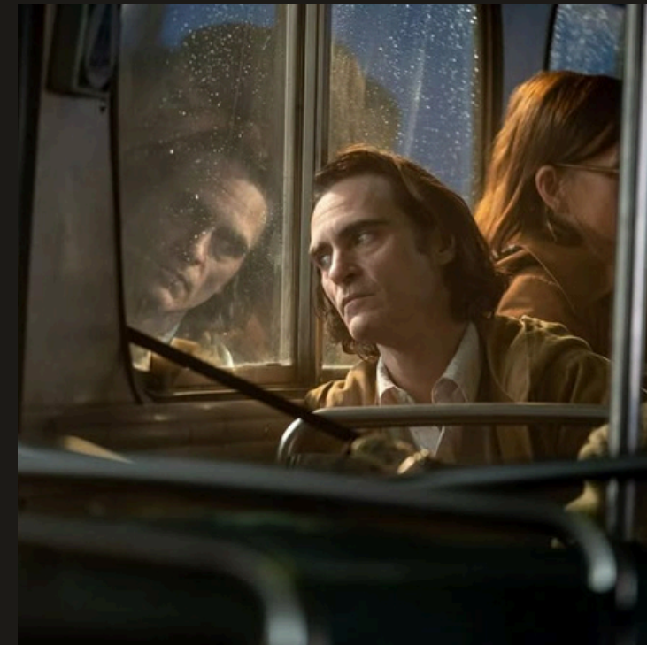
Sat on bus/tube (incorporating chorus lyrics into shots i.e. staring at shoes and noticing people notice him)