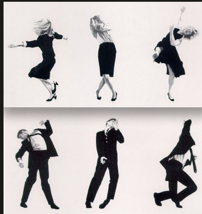
Other suited people dancing in unsettling way on the street, foreshadowing Sam's future state