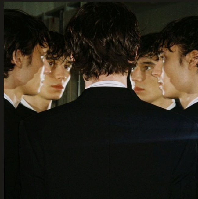
Mirror with multiple (self) reflections