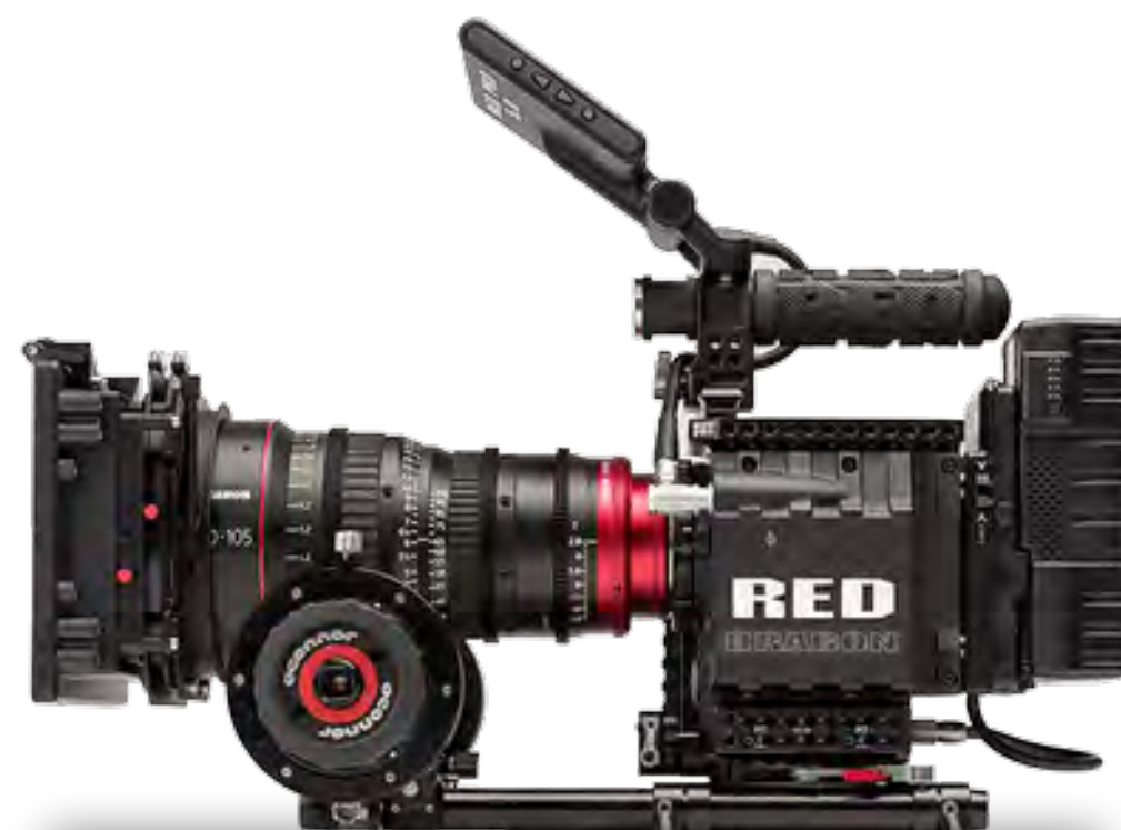
RED HELIUM 6K