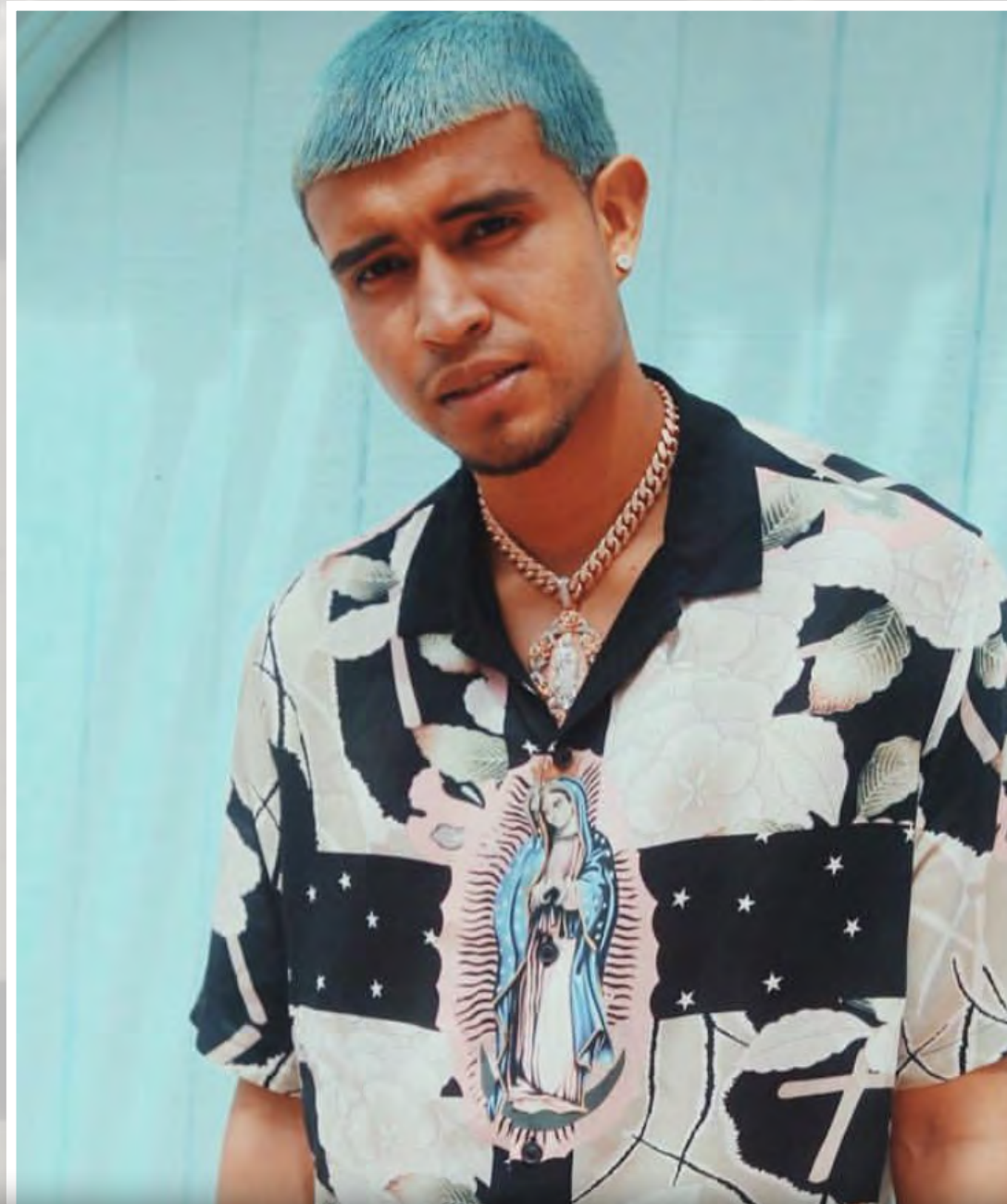
KAP G AS HIMSELF

We will be casting our actors and extras through professional casting notices posted on Casting Networks/LA Casting here in Los Angeles.