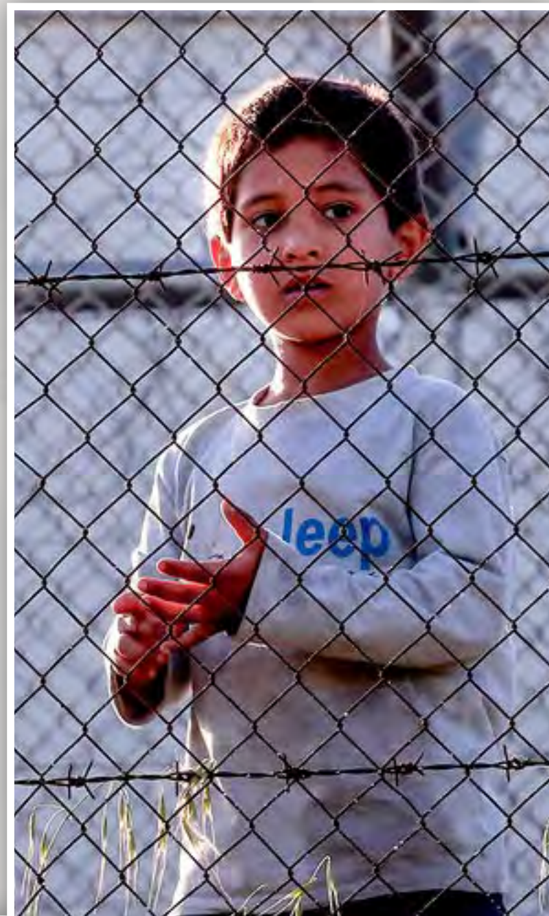
IMMIGRANT CHILD - LEAD