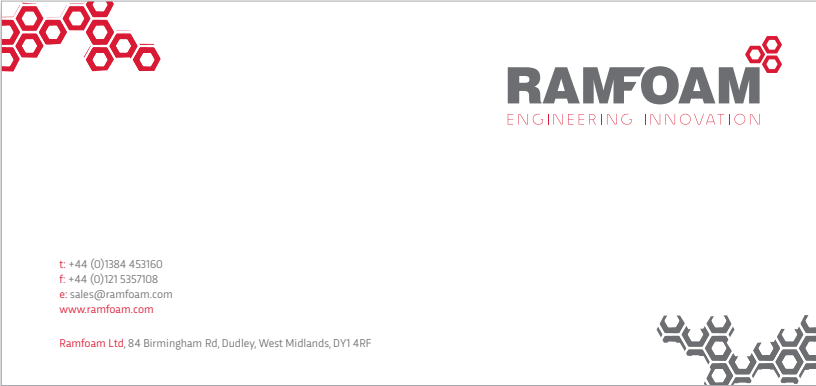
Example of letterhead and compliment slip design.