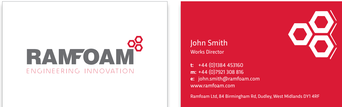
Example of business card.