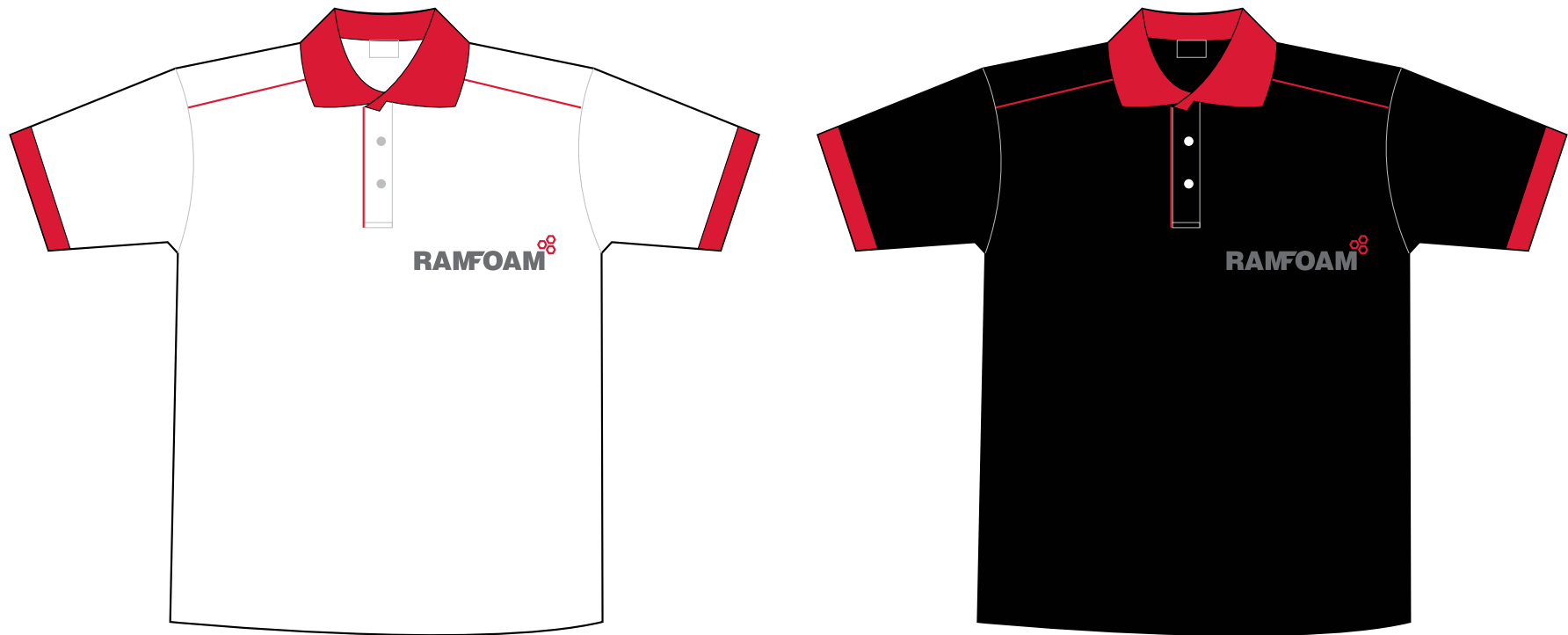
Example of using the Ramfoam logo on workwear.